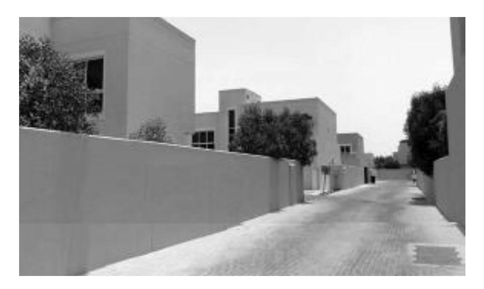
Figure 3 Boundary walls restrict levels of surveillance.

The second limitation regarding surveillance relates to the requirement for shade, particularly within the traditional walkways (sikkak) which connect residential developments throughout old and newer neighbourhoods. Although sikkak enhance connectivity between neighbourhoods, the Abu Dhabi climate means that, unless such pathways are shaded, residents are unlikely to choose to walk. For this reason, many of sikkak had been designed