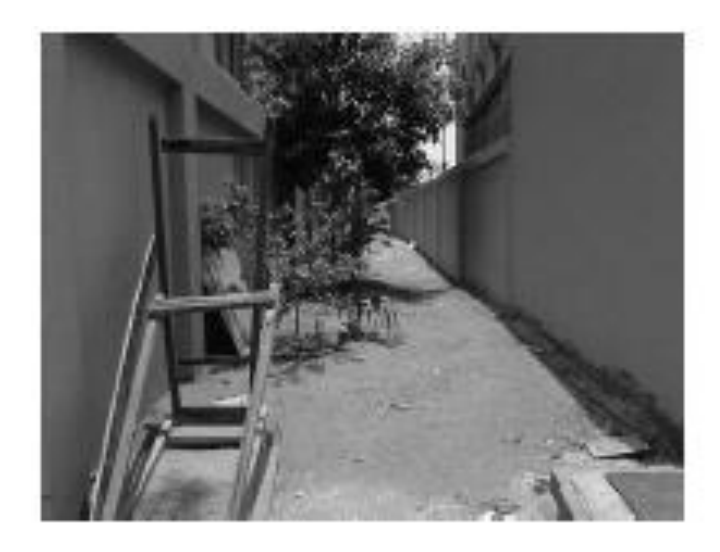
Figure 1 . Example of an unused sikka .