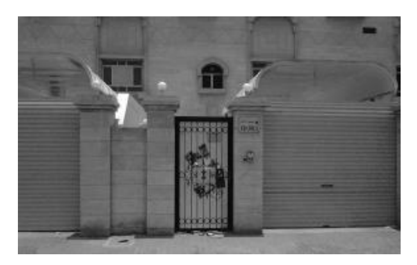
Figure 5 Post left in the front gates of properties.

As was highlighted under access and movement, the cultural importance of owning four boundary walls and the status associated with this (as opposed to sharing with a neighbour) has created areas of unused, unmanaged public space (sikkak) which are not large enough to act as pathways, nor to be used for public, legitimate activities. While these areas should be maintained by the local municipalities, evidence suggests that they are often left unmanaged with an abundance of litter and left over building materials, which in some cases could be used to aid access over the private boundary walls (see figure 6).