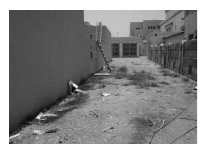
Figure 6 An example of unmanaged public space.

As was highlighted under access and movement, the cultural importance of owning four boundary walls and the status associated with this (as opposed to sharing with a neighbour) has created areas of unused, unmanaged public space (sikkak) which are not large enough to act as pathways, nor to be used for public, legitimate activities. While these areas should be maintained by the local municipalities, evidence suggests that they are often left unmanaged with an abundance of litter and left over building materials, which in some cases could be used to aid access over the private boundary walls (see figure 6).